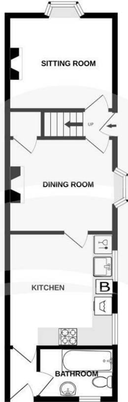
GROUND FLOOR 42.7 sq.m. (459 sq.ft.) approx.